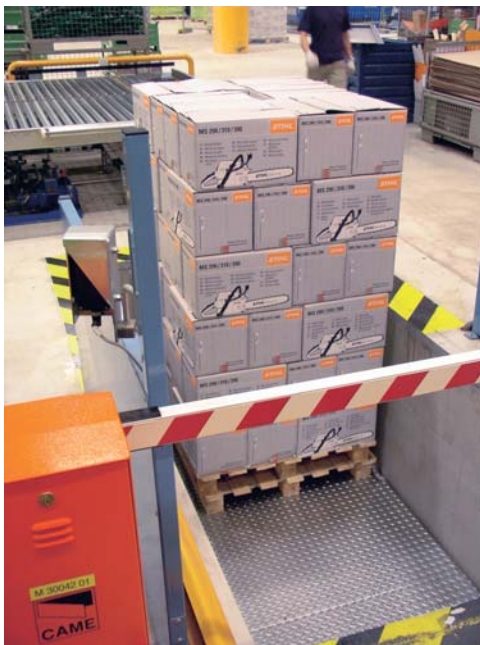
lifting table for a manual unpalettiser